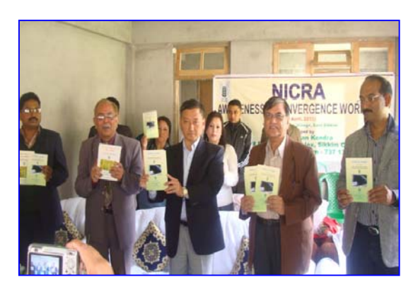
Release of technical folders by Chief Guest