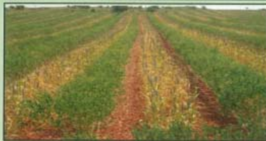
Pearl millet and pigeonpea (5:1) with advanced sowing