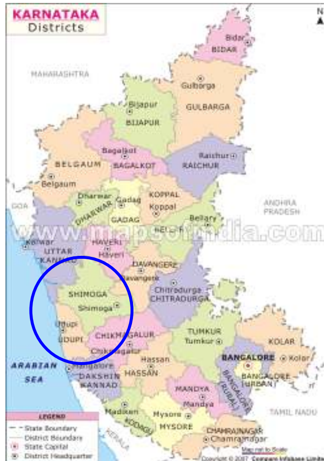
Annexure – 1: Location Map Of Shimoga District In Karnataka