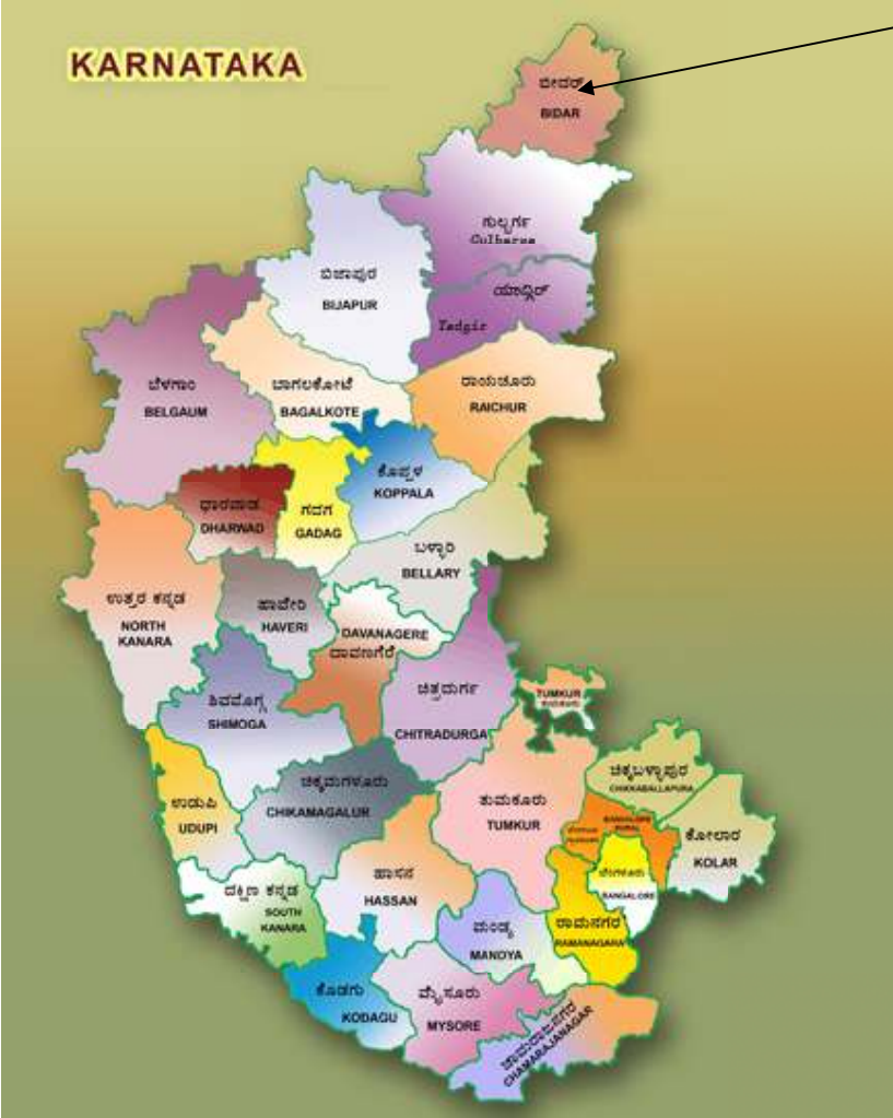
Annexure-1 Location map of Bidar in Karnataka