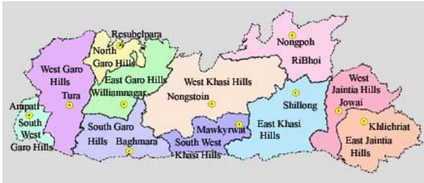
Location map of East Khasi Hills